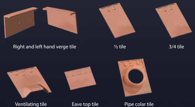
Right and left hand verge tile